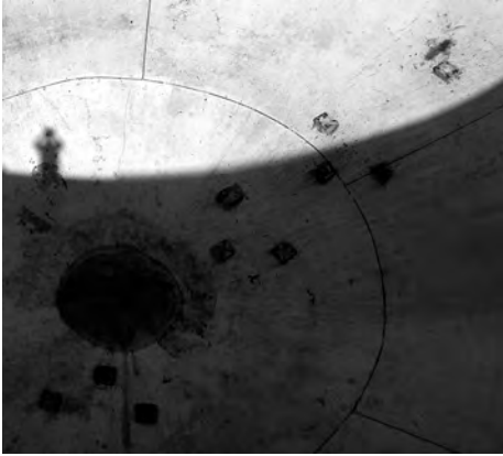
The digester bottom — recently home to 30 years of solid sludge — has been emptied and cleaned.

The Clean Rivers, Clean Harbor, Sound Norwich Sewage System Reconstruction project took a step forward this spring when repairs began on the digester portion of the treatment plant. The digester breaks down solids removed from the sewage treatment process. When it needs repair, it can be the largest contributor to treatment plant odors.