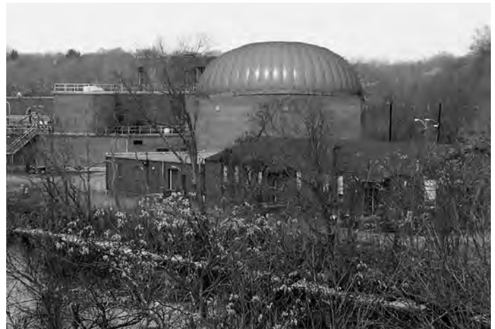
At left, what the sewage treatment plant looks like now before the new dome-shaped cover is added, at right. This is the only change to the plant that will be visible from the road. The new cover will help NPU turn sewage treatment gases into renewable energy.